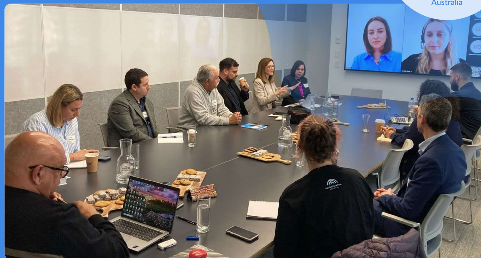
Lion industry representatives attending meeting for the 2024 Reconciliation Week.

As part of our second Innovate RAP which will launch later in 2025 we look forward to furthering the work already undertaken with the RING.