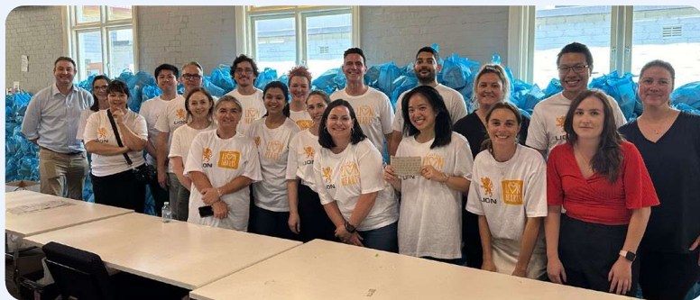
Pictured: The Legal, Risk, CD5 and Sustainability Teams volunteering in 2024

In 2024, Lion reached a total of 6,777 volunteering hours, marking our highest achievement to date. Team members dedicated valuable time to charities such as FareShare, IndigiGrow, Landcare Australia, Loaves and Fishes restaurant, Sustainable Coastlines, and the Graeme Dingle Foundation. This total represents a significant increase from our 2021 baseline of 2,000 hours, underscoring that volunteering has become an integral part of Lion's culture.